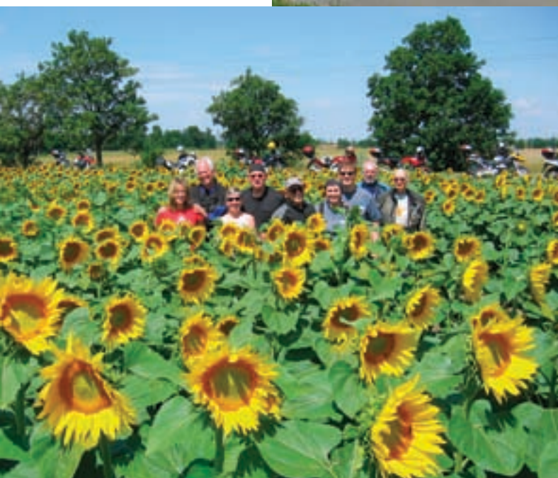
Top: Great riding on traffic-free roads through Czech countryside. Top right: Karlstejn Castle: Karlstejn is the true star in the constellation of castles in Czech. Above: A short stop among sunflowers in Hungary. Right: Guided sightseeing tour around Budapest.